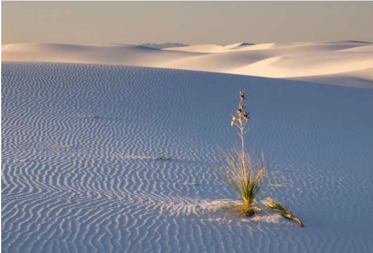
Pol Syrett: White Sand