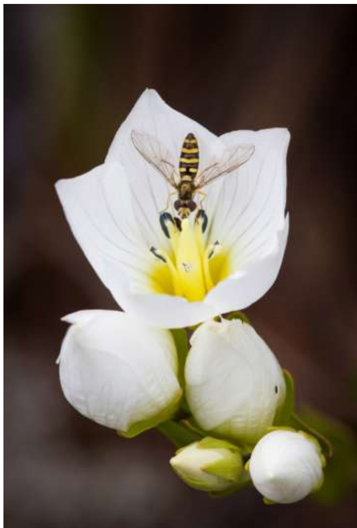
Sonja Teague: Fly on a flower