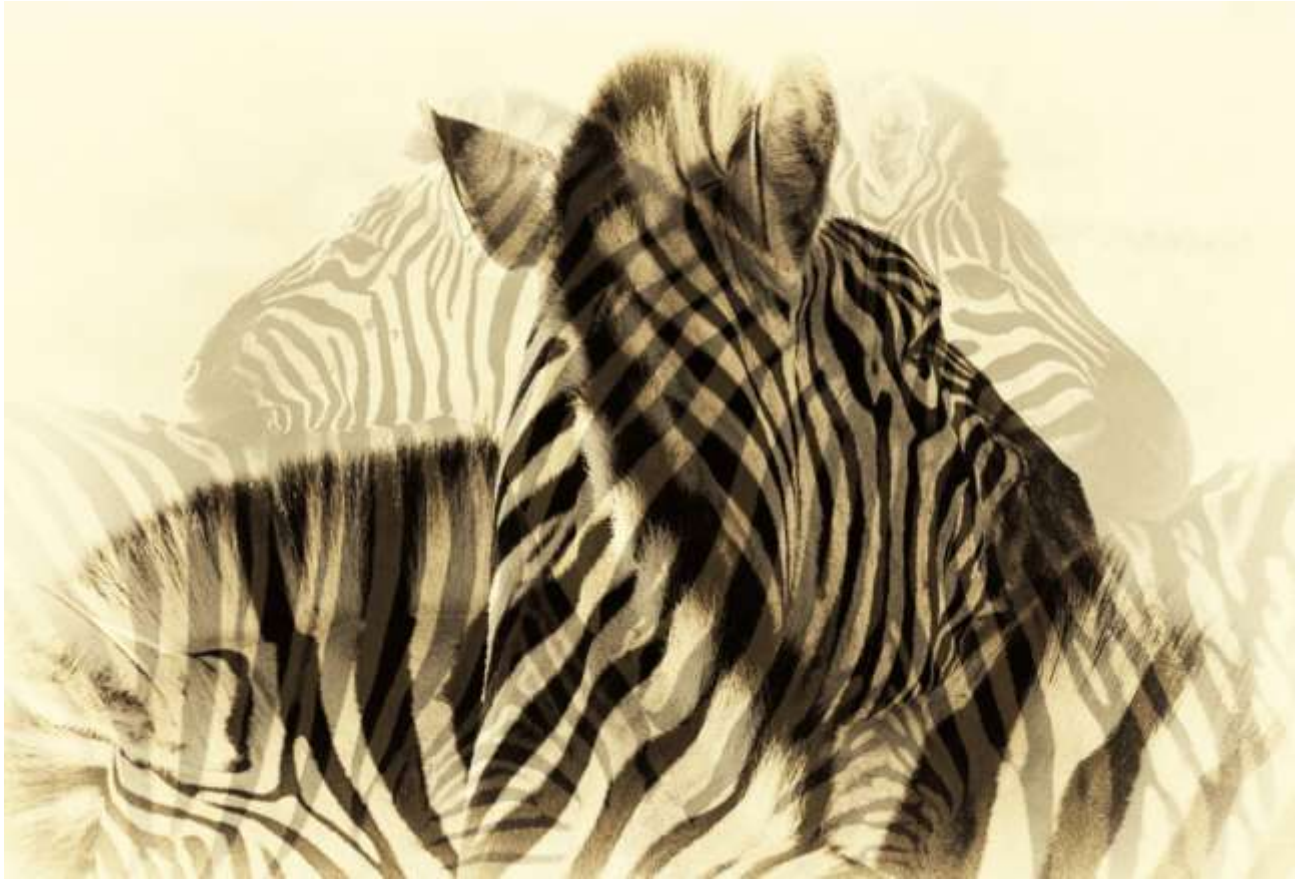
Meg Errington: Zebra Crossing