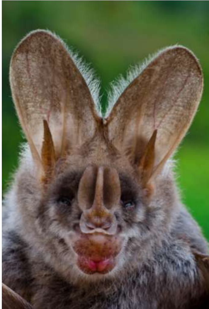
Long eared bat, Sri Lanka