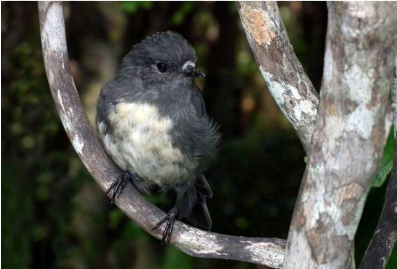
NZ Robin