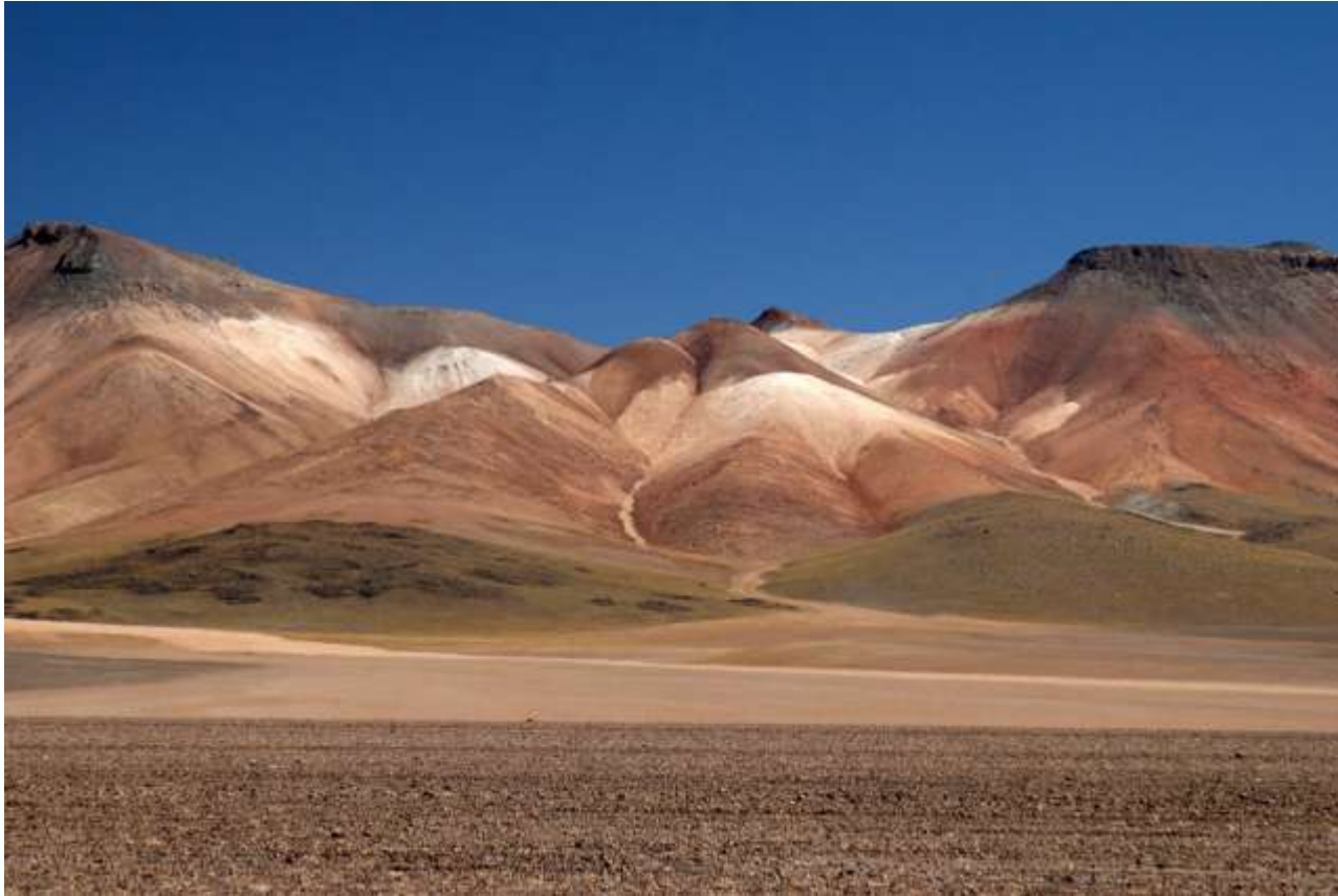
Sur Lipez Province, Bolivia