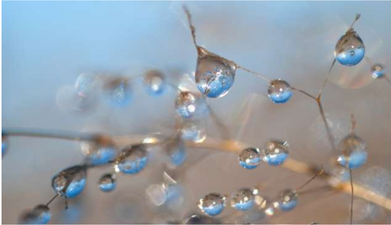
Robyn Owen: Frozen Dew