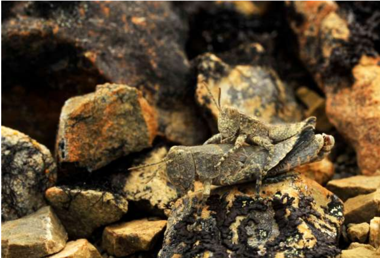
Jane Coulter: Grasshoppers