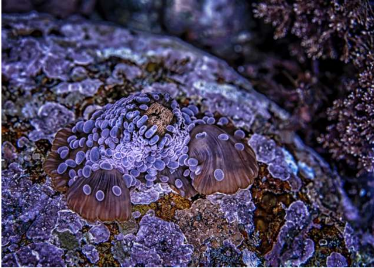
Priscilla Chapman: Wandering Sea Anemone. West Coast