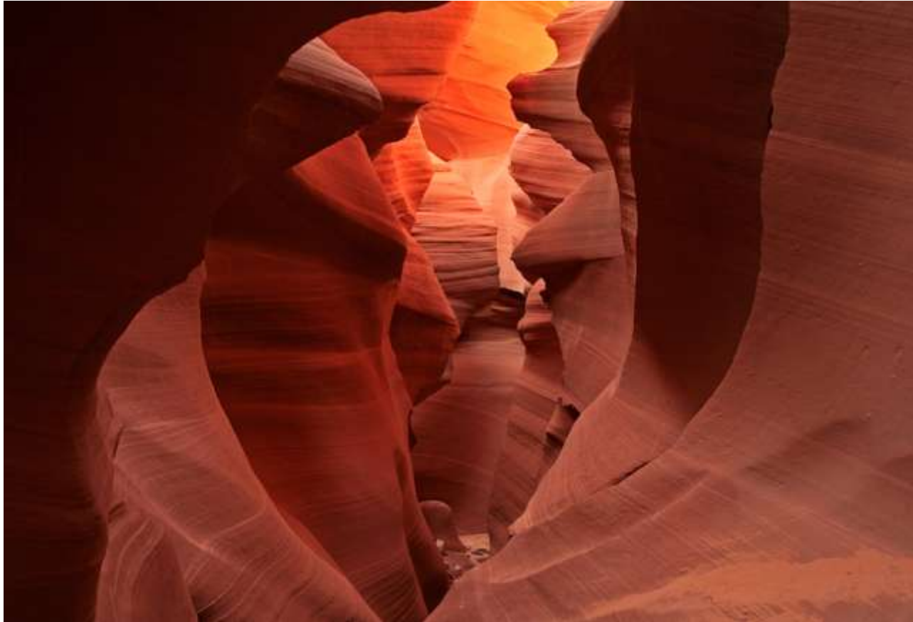
Pam Phillips: Lower Antelope Canyon