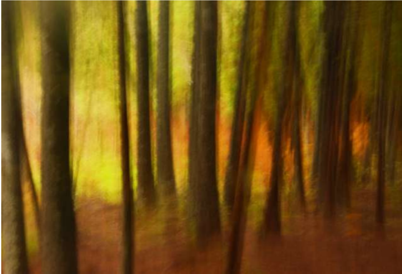
Alice Dupont: Autumn in the woods