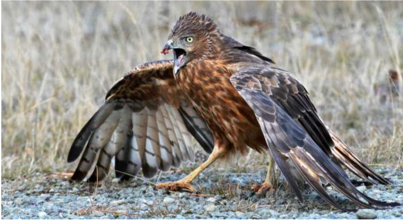
Bevan Tulett: Angry bird, Australasian Harrier