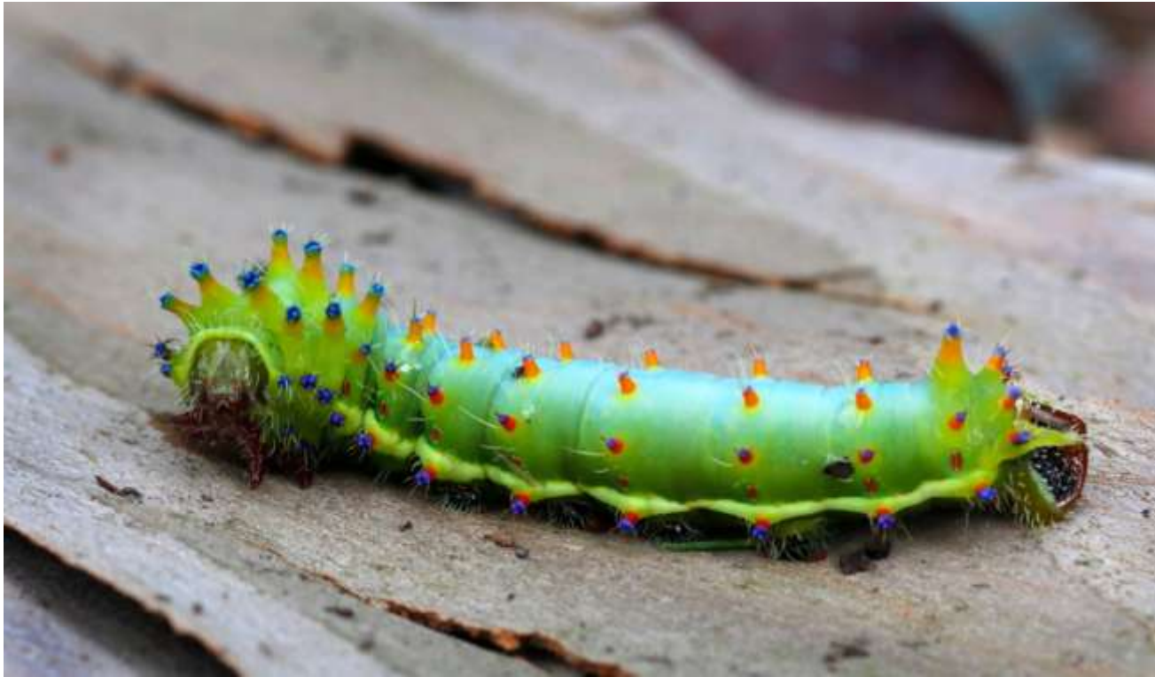
Alan Scarlet: Nancy Tichbornes garden