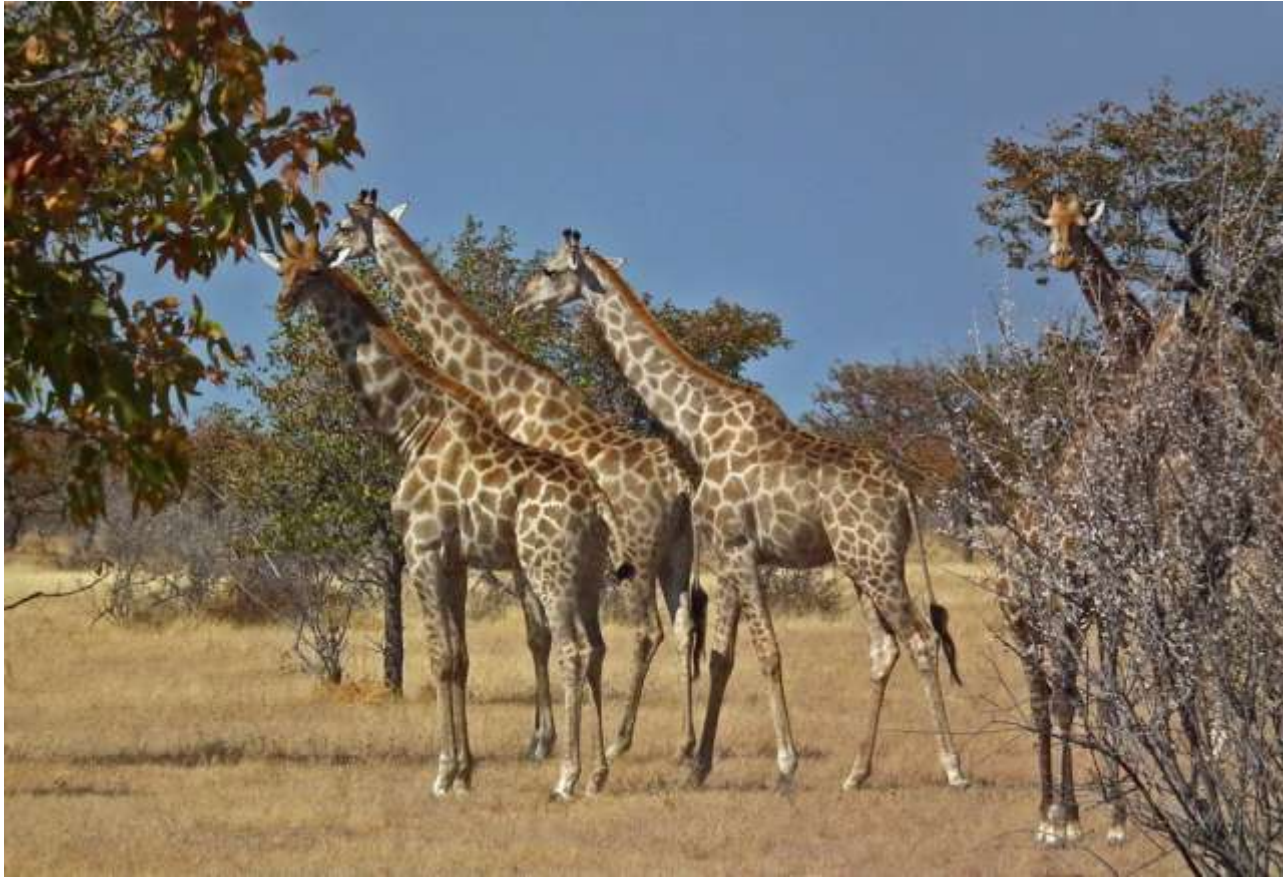
Bert Geerkens; Giraffes in Namibia