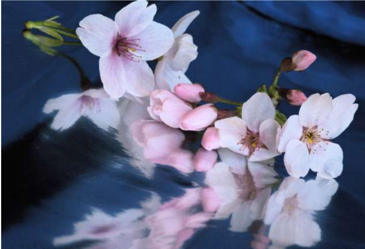
Lesley Tuffley: Sakura - Reflections of Transience