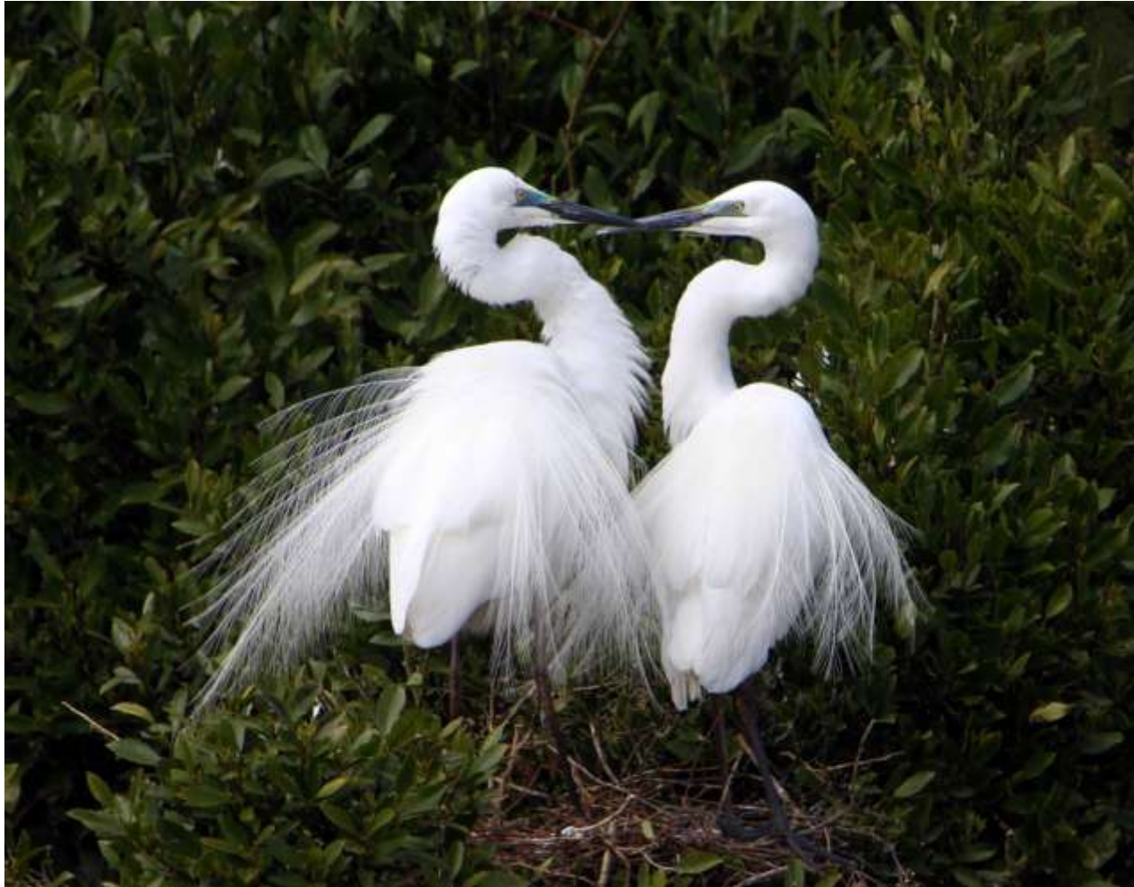
Trish Brown: Kotuku in Breeding Plumage