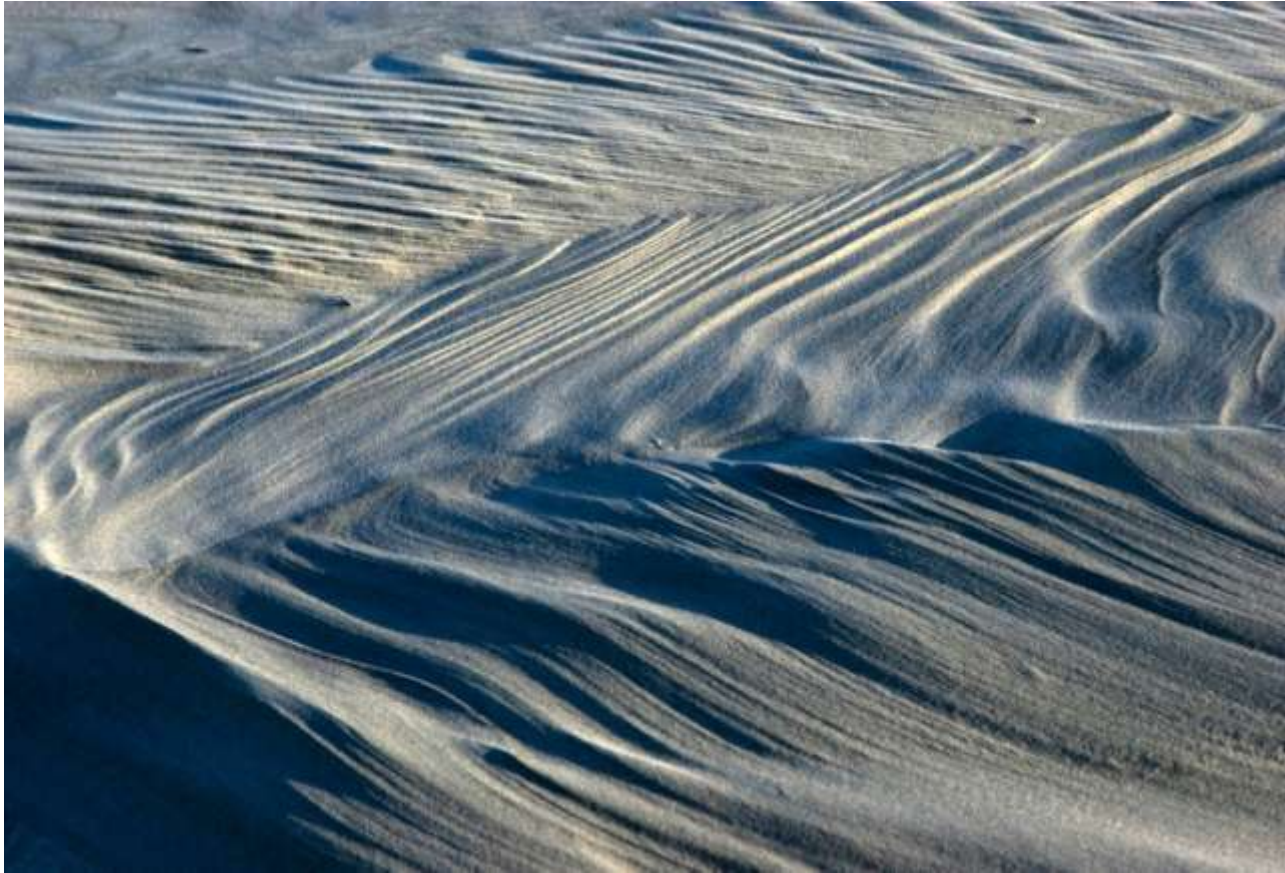
Lynda Acton-Adams: sand patterns