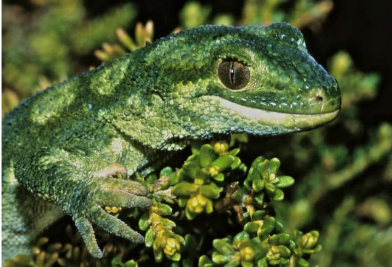
Carl Thompson: Green Ghekco