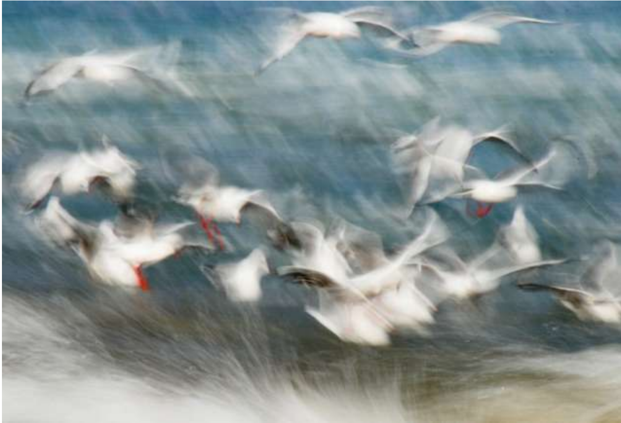
Sally Mason: Sea gulls