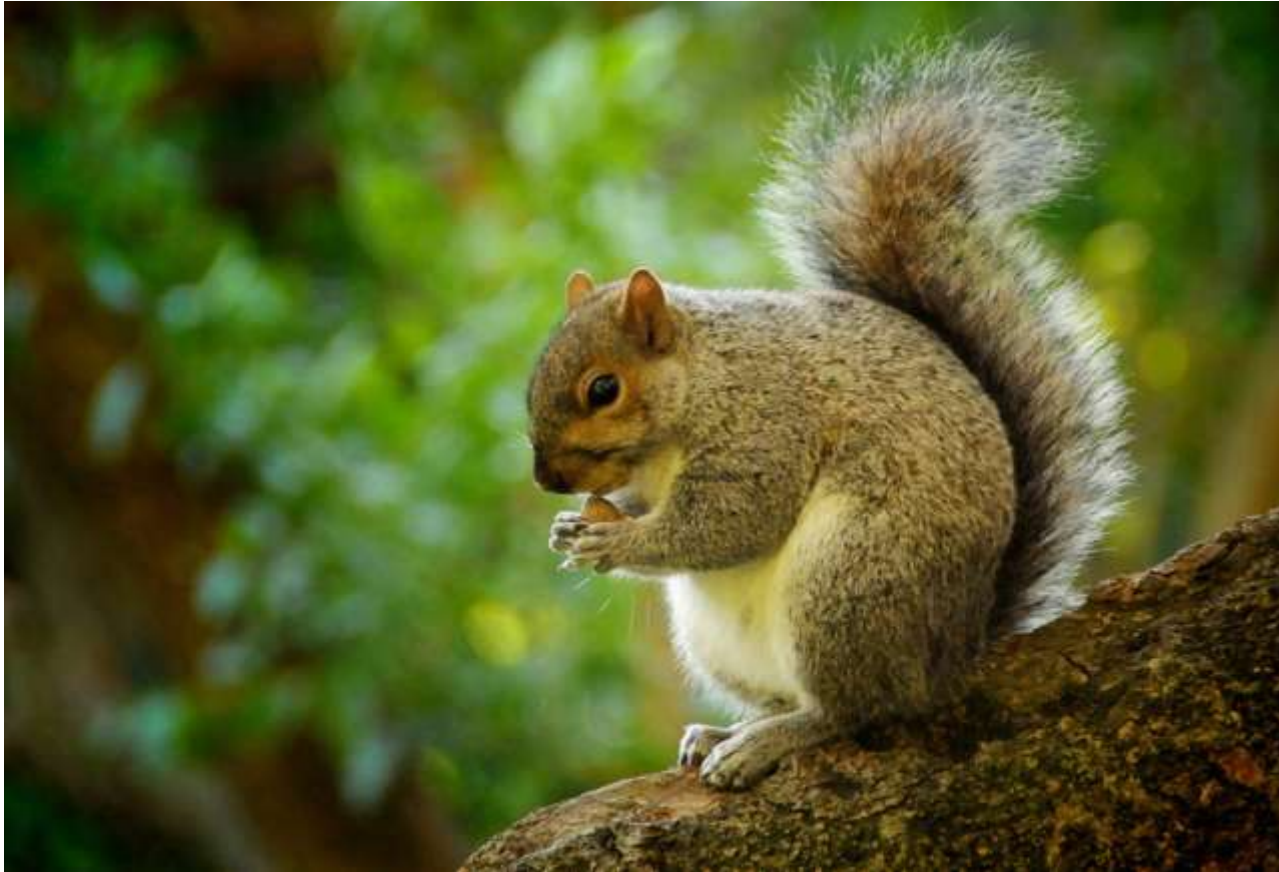
Newell Grenfell: Eastern Grey Squirrel