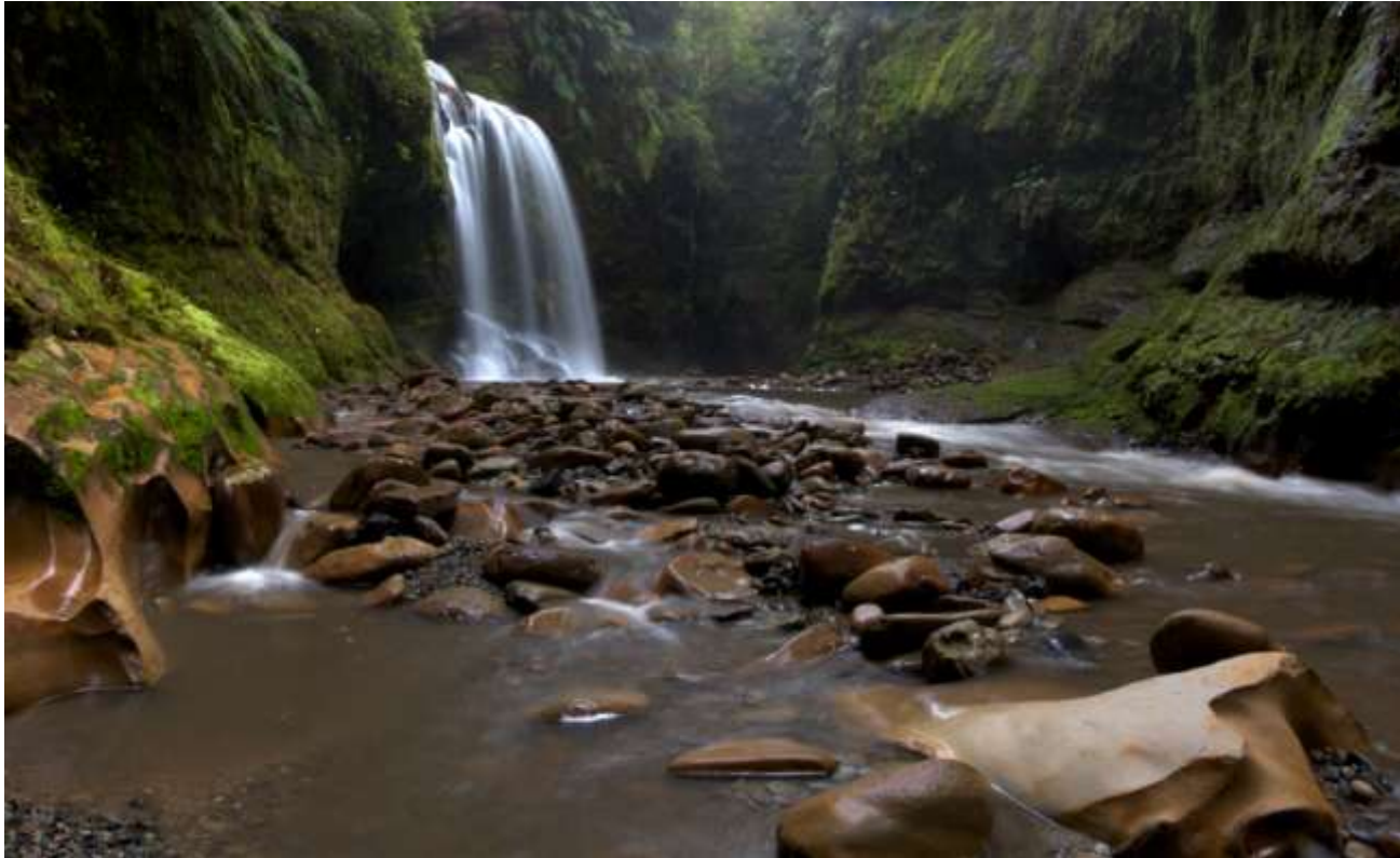
Murry Cave: Paparoa