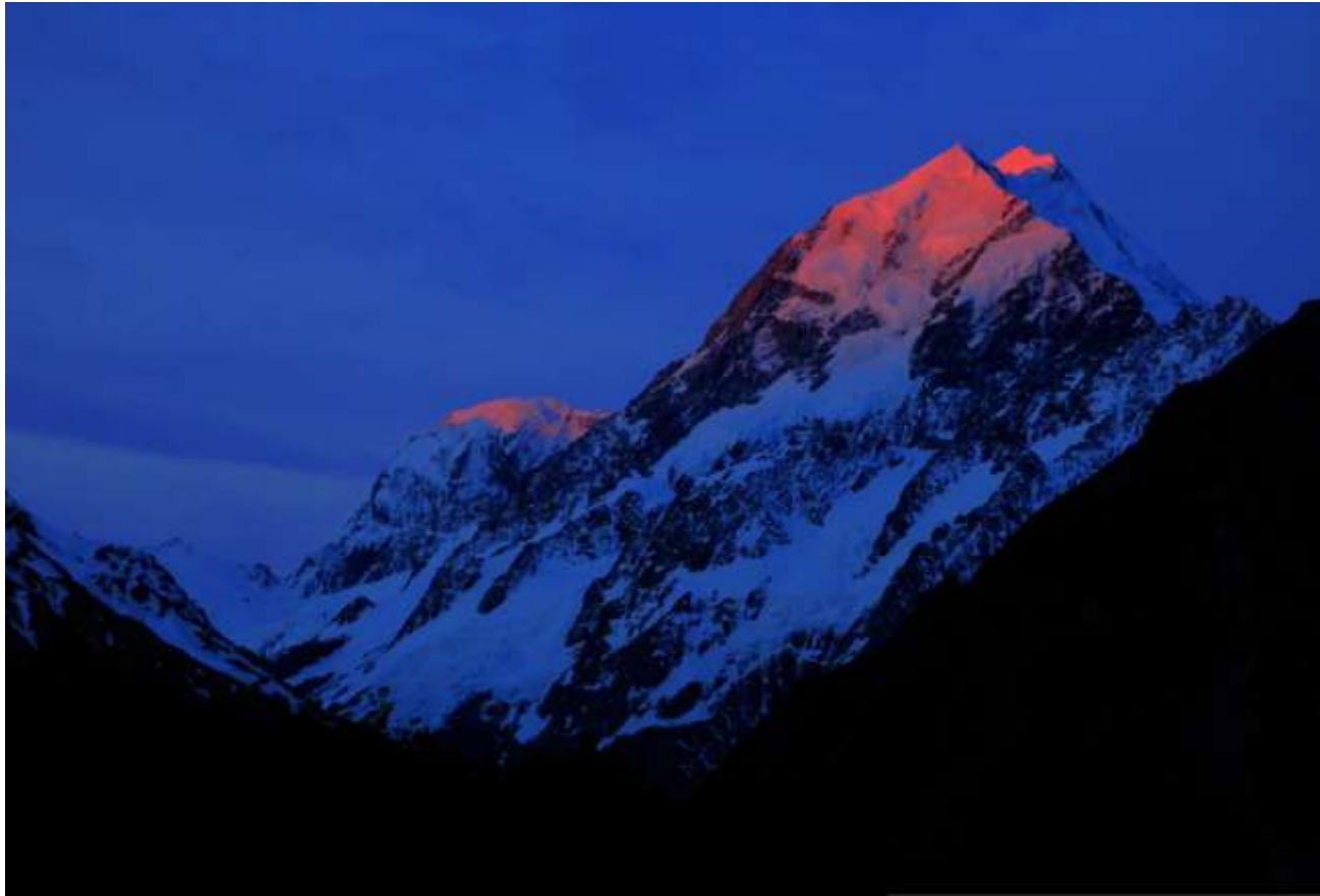
Kath Varcoe: Alpenglow on Mt Cook