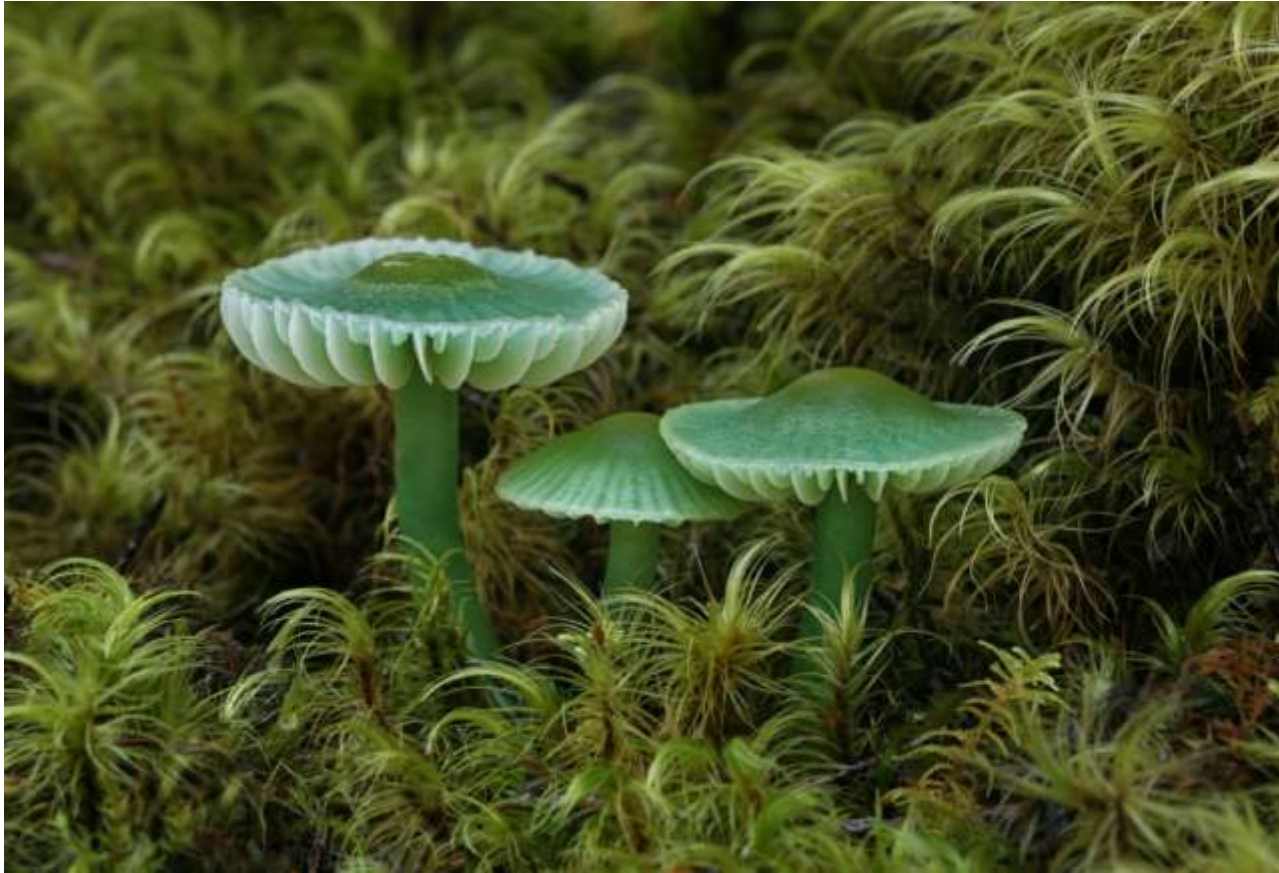
Pam Cumming: Gliphorus viridis