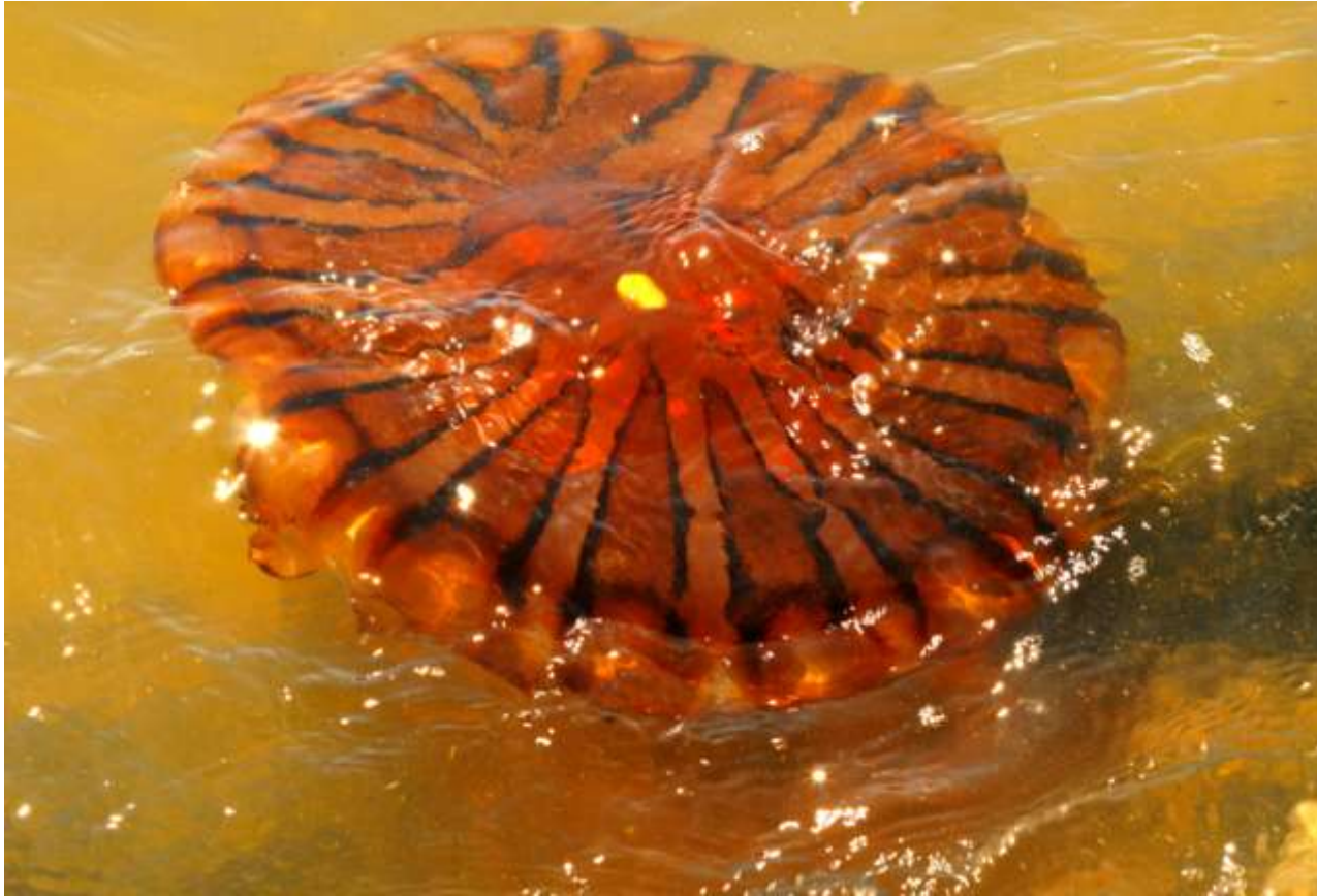
Lorraine Wilmshurst: Jellyfish, Namibia