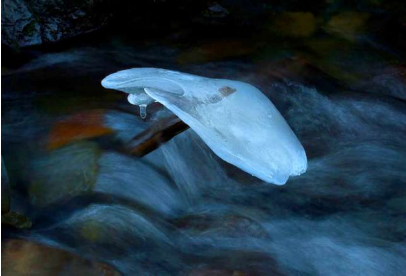
Yvonne Marshall: Ice Sculpture