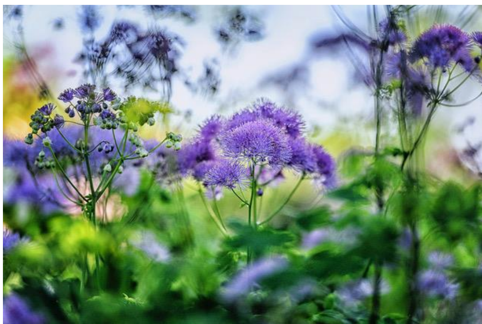
Peek-a-boo: Priscilla Chapman