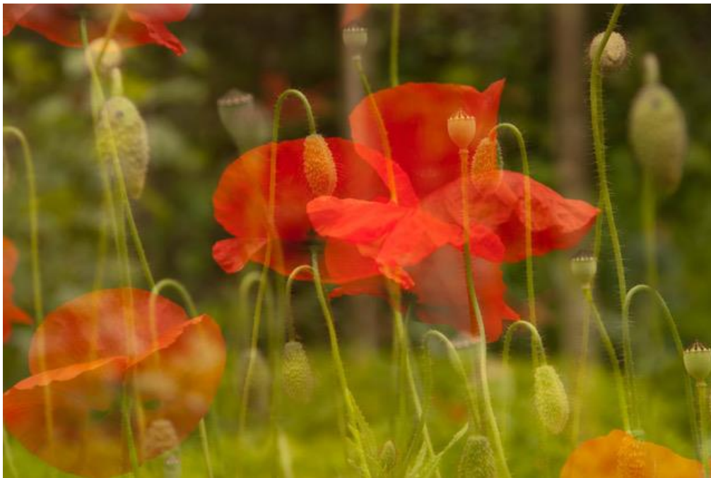
Power of Red: Robyn Owen