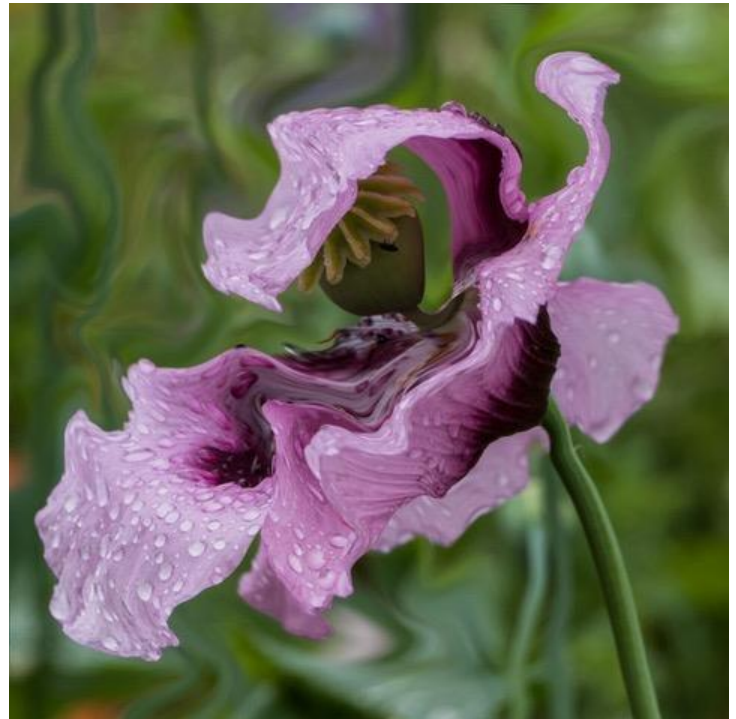
Hallucination in the garden: Meg Errington