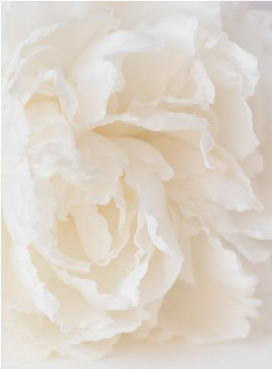
White Rose: Pol Syrett