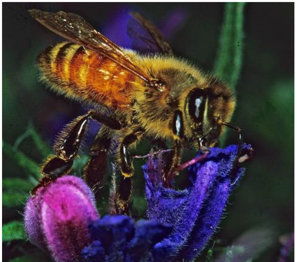
Bee on Blue Borage: Carl Thompson