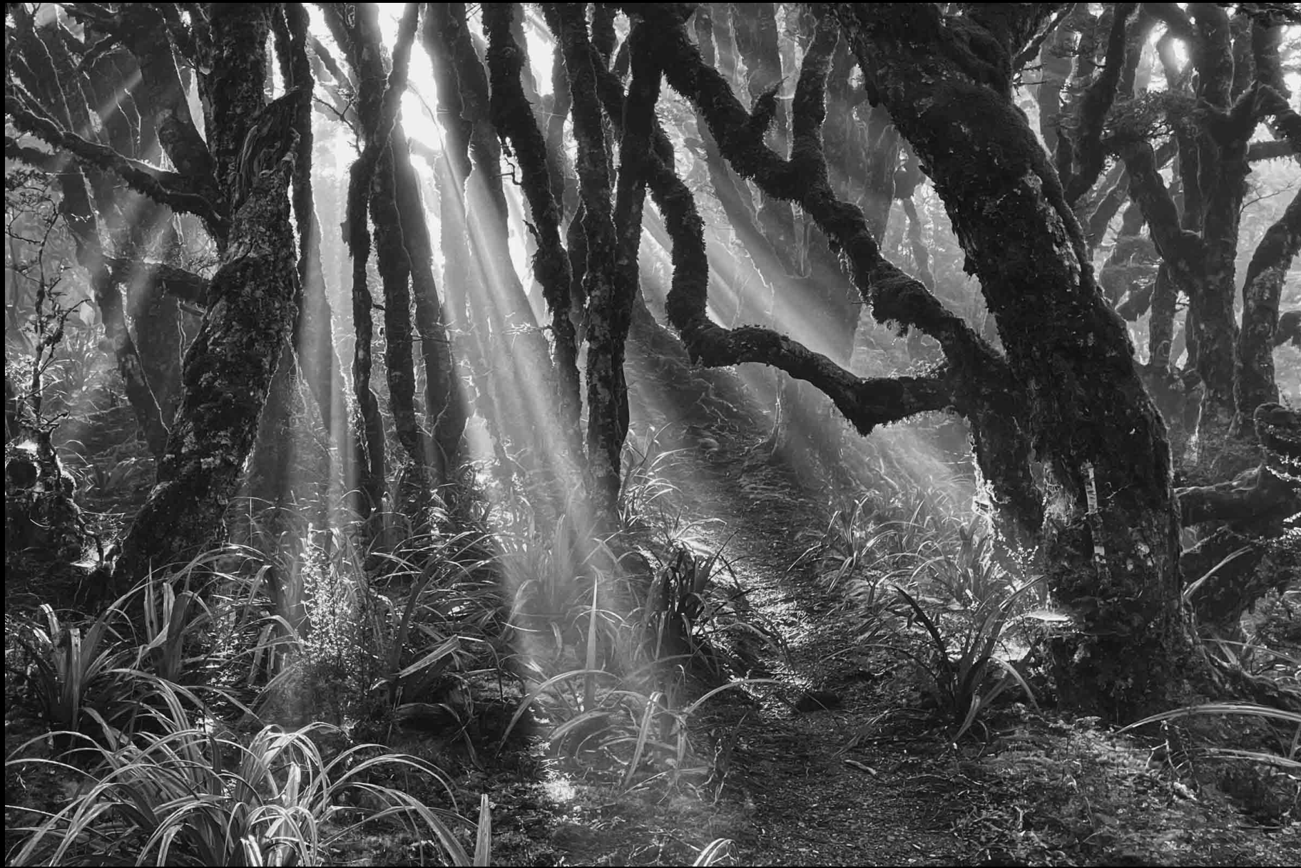
Forest Fog Beams: Robyn Owen