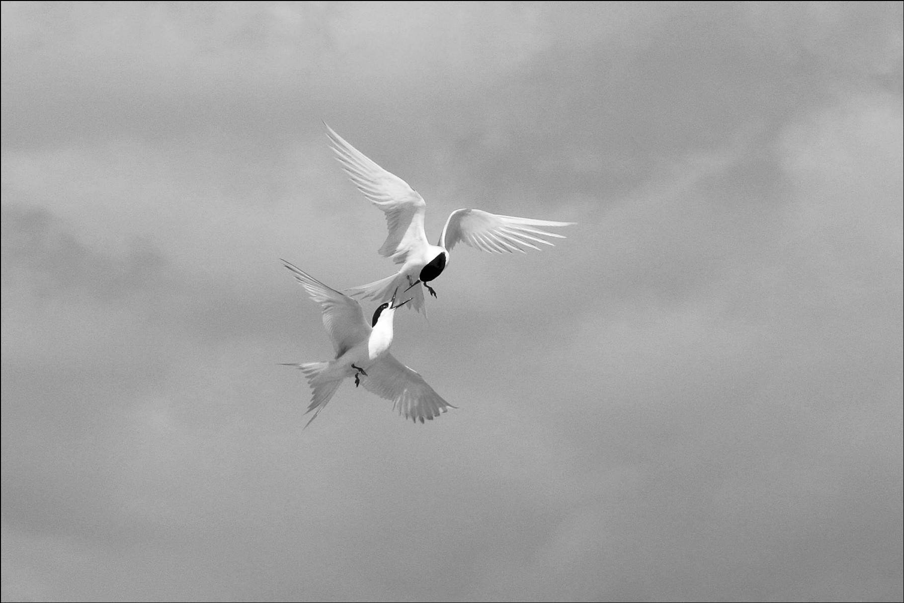
Terns fighting: Trish Brown