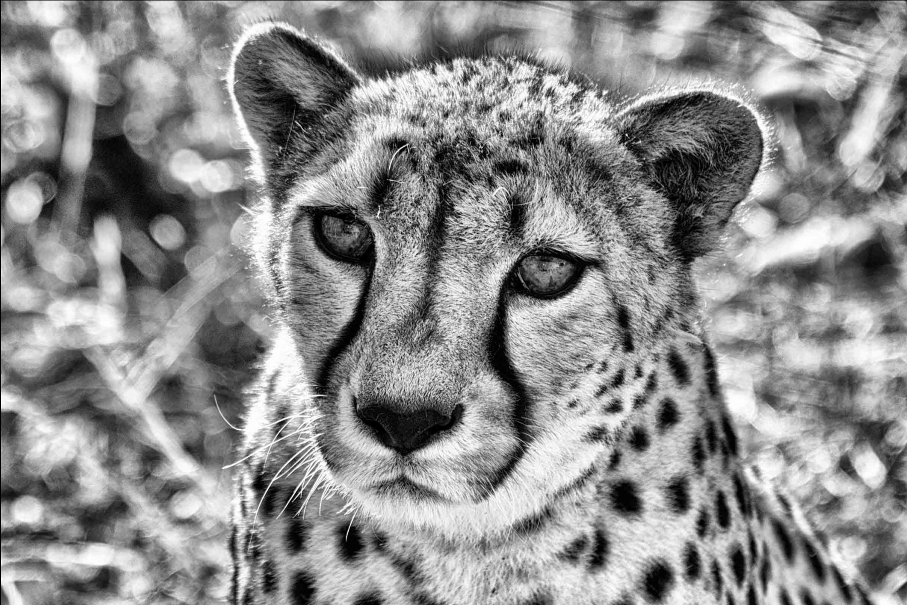
Cheetah: Sue Blair