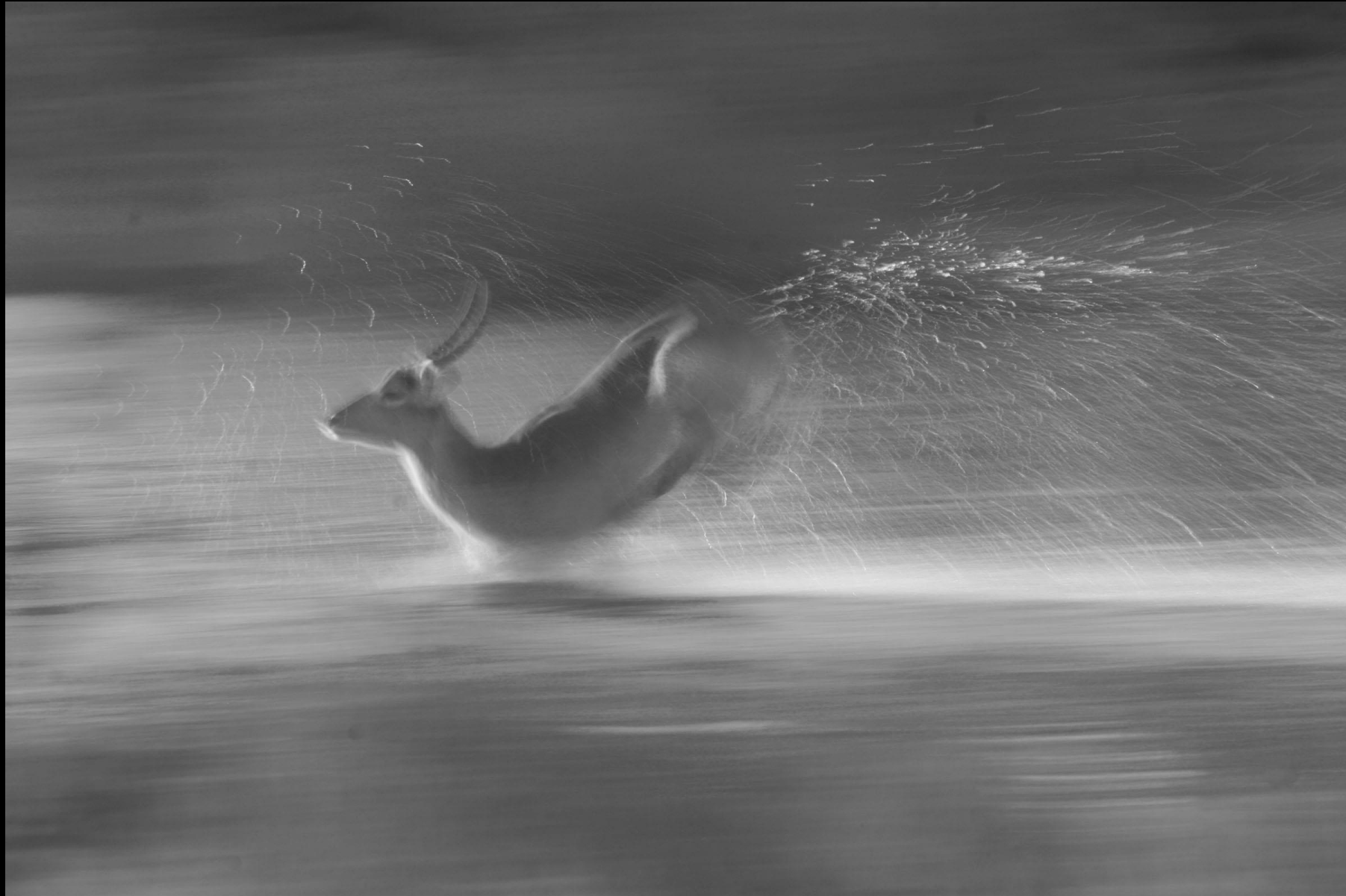
On the move: Owen Ragg