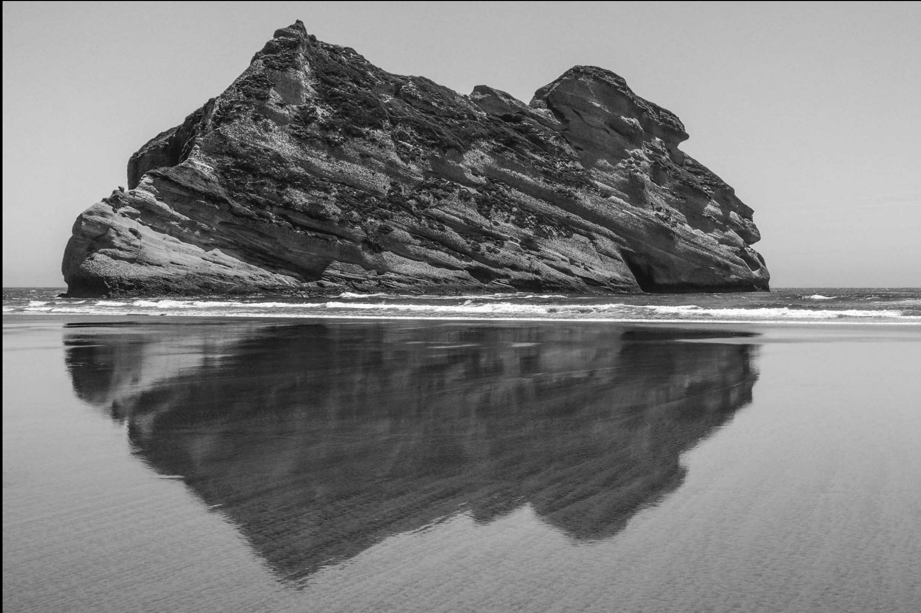
Wharariki reflections: Remco Baars