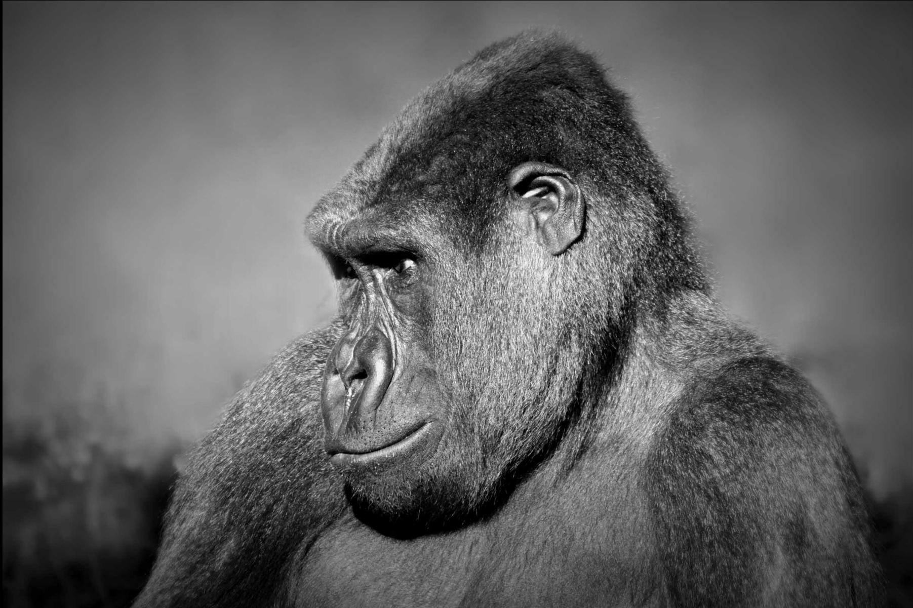
Silver-Back playing coy