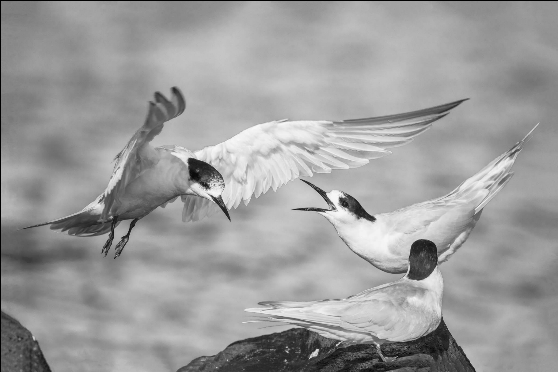
Tern Dispute: Dawn Kirk