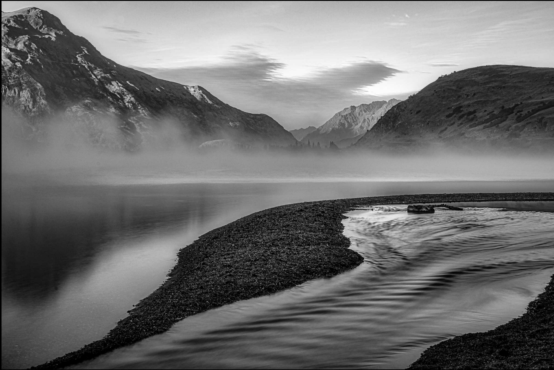
Lake Hayes: Bill Cabout