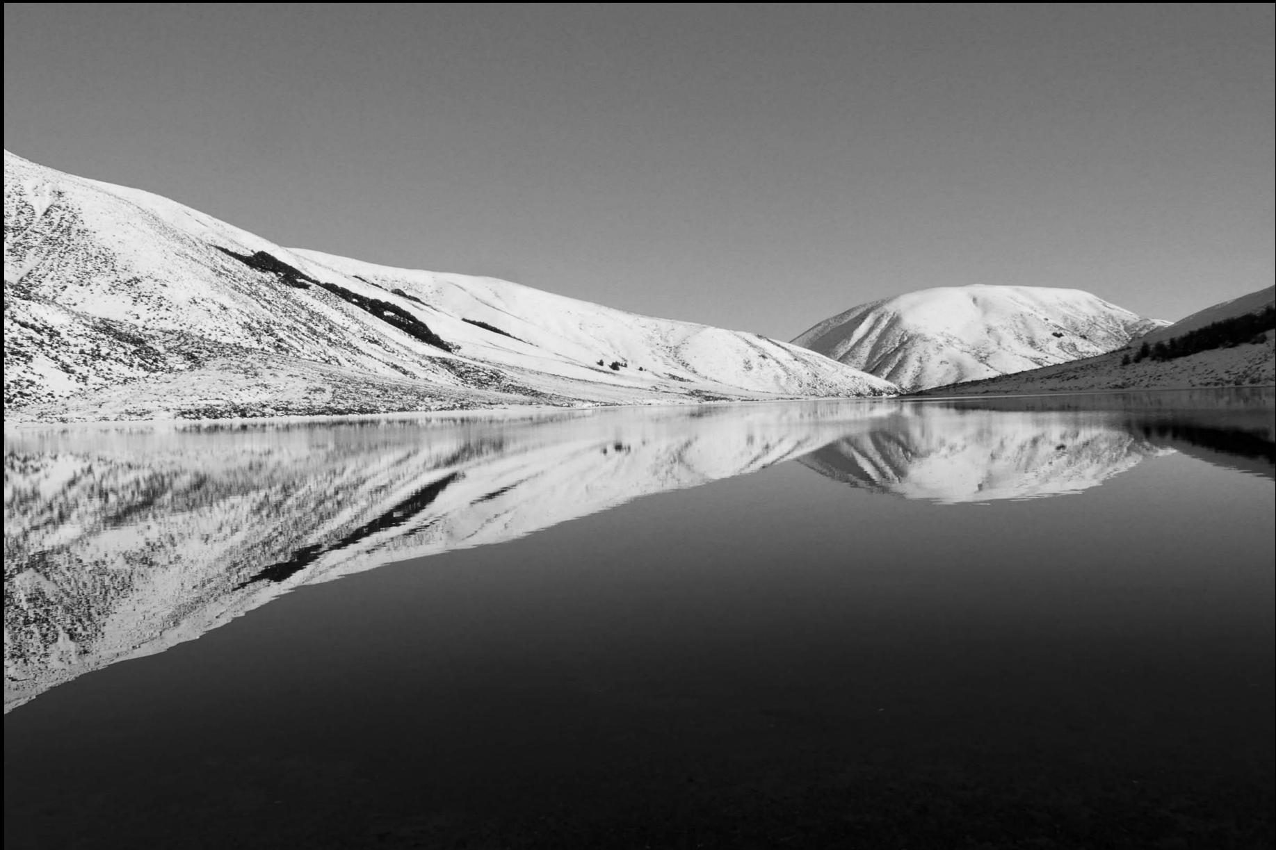
Lake Lyndon Winter: Eleanor Ragg