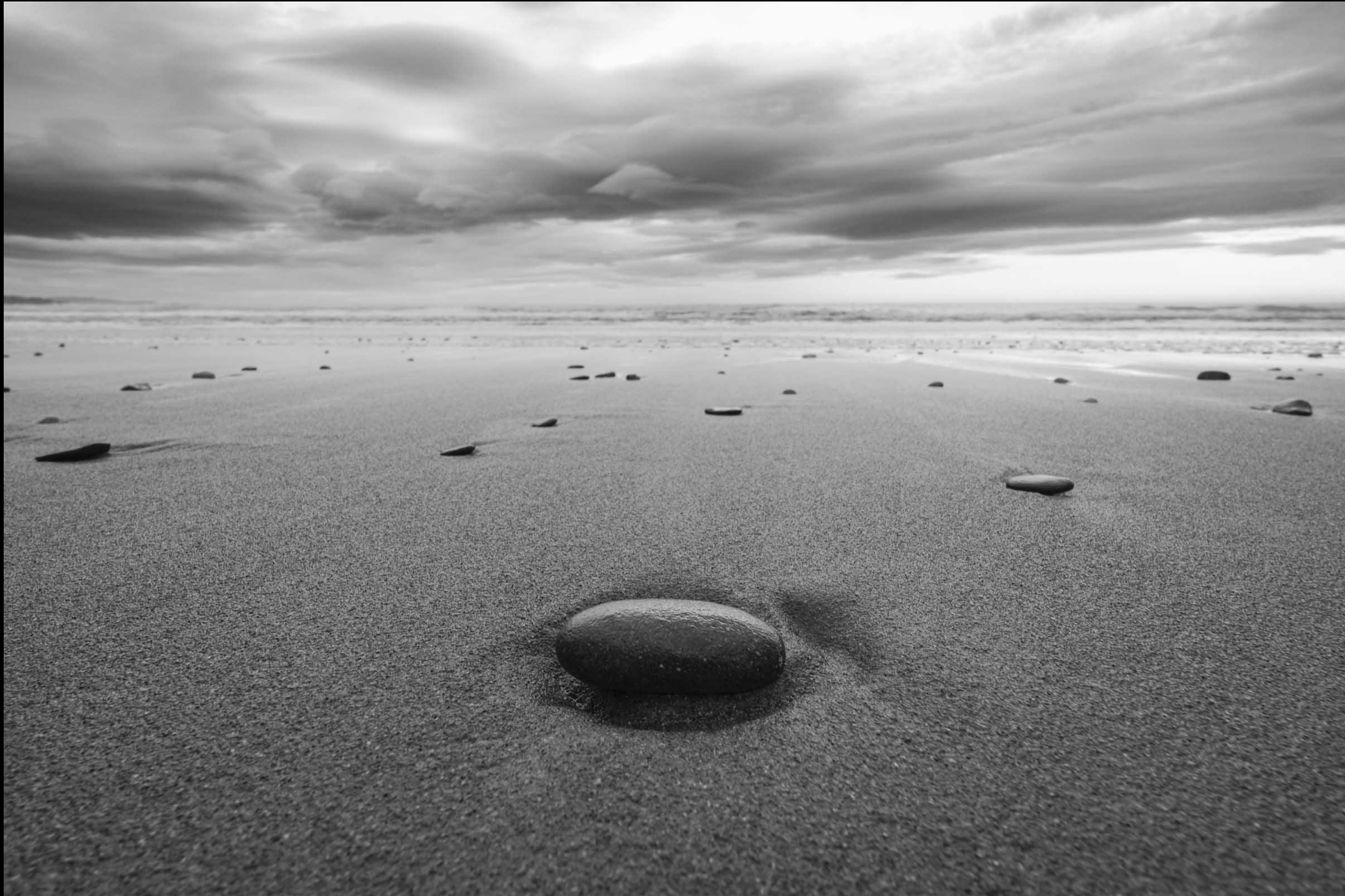
Stone on calm beach: Jane Coulter