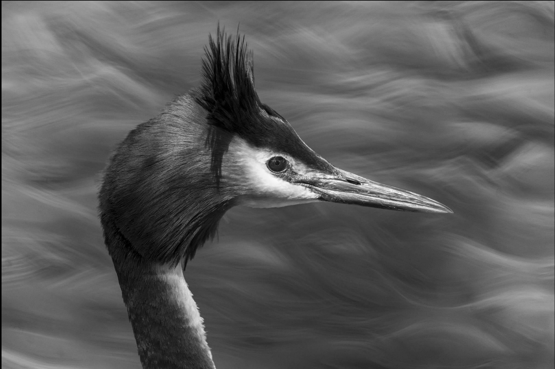
Crested Grebe Portrait: Gaynor Hurst