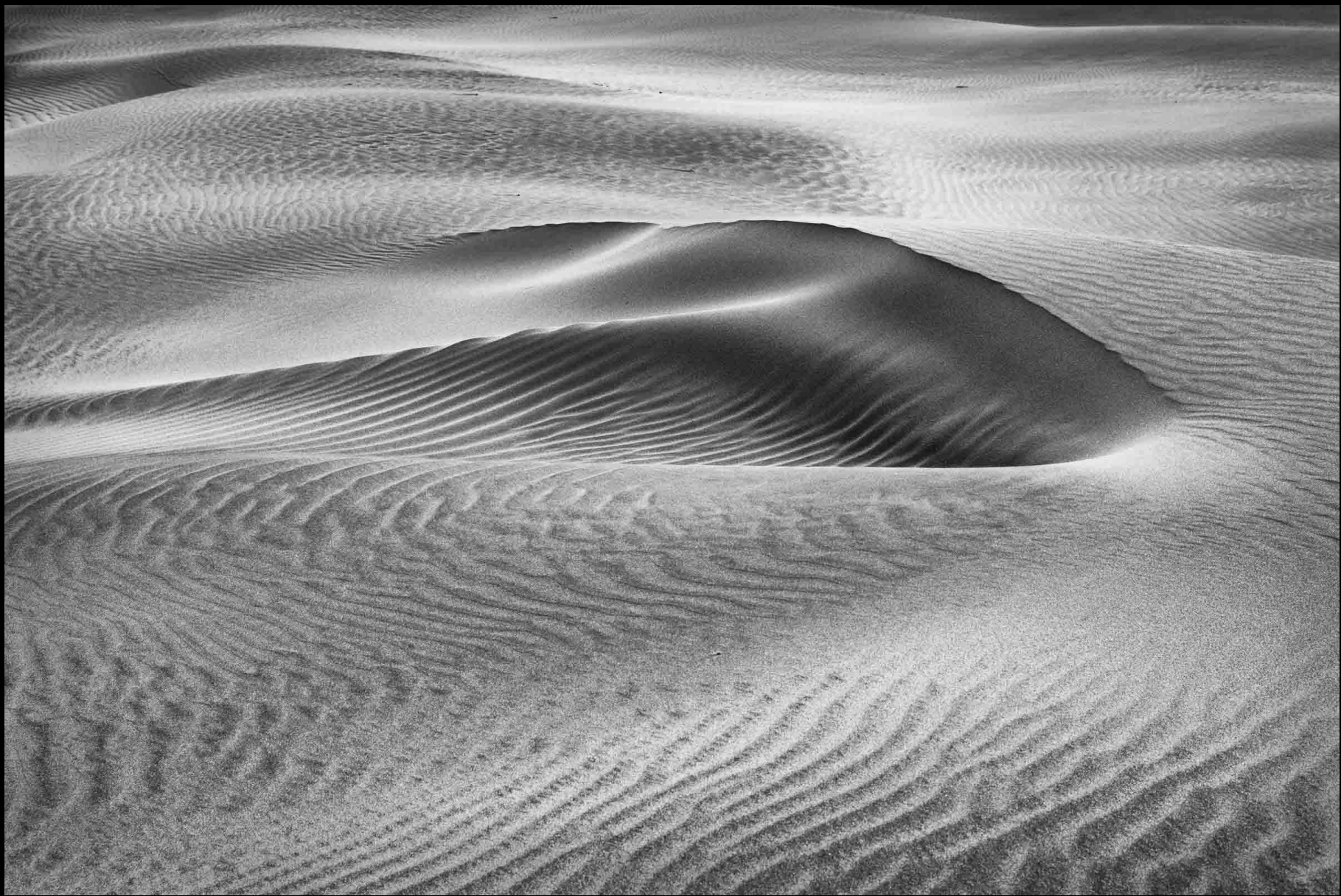
Transitory Textures: Gundis Bort