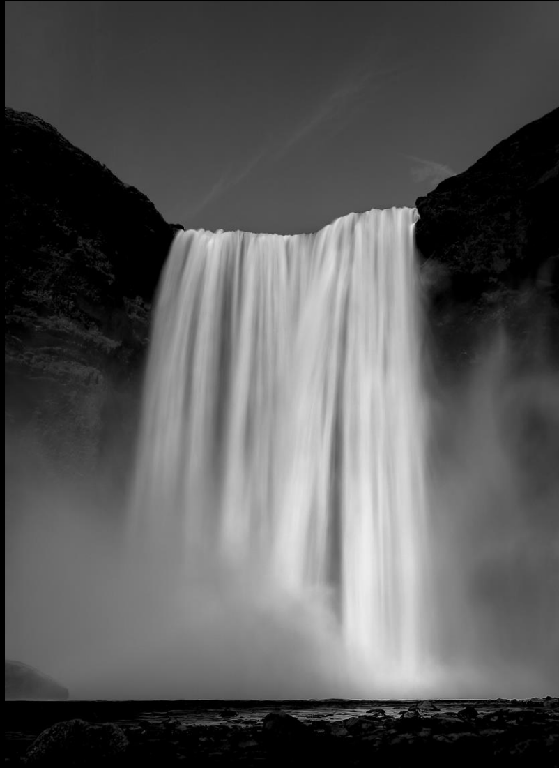
Skogafoss, Iceland: Linley Earnshaw