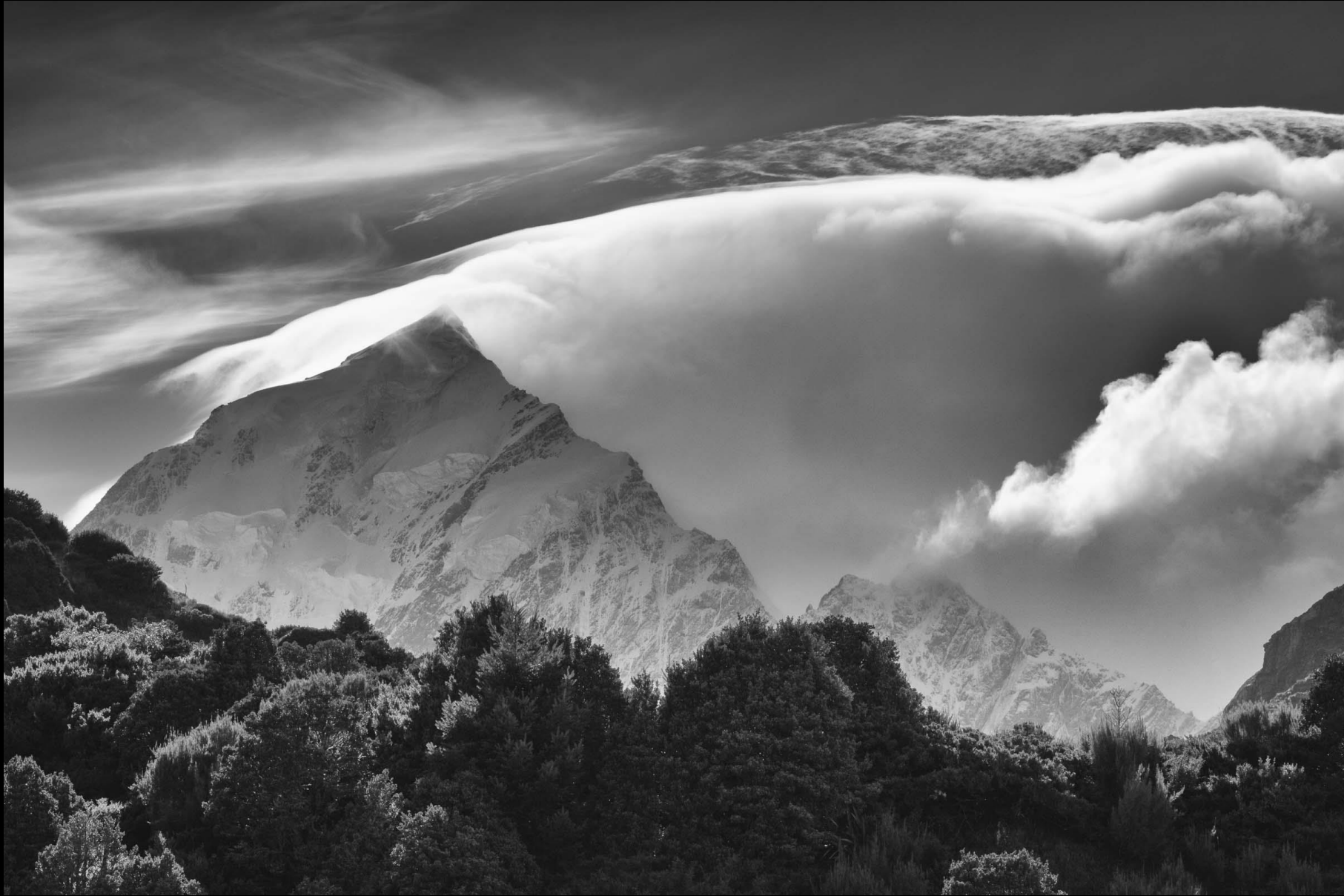
Storm Clouds over Aoraki: Pol Syrett