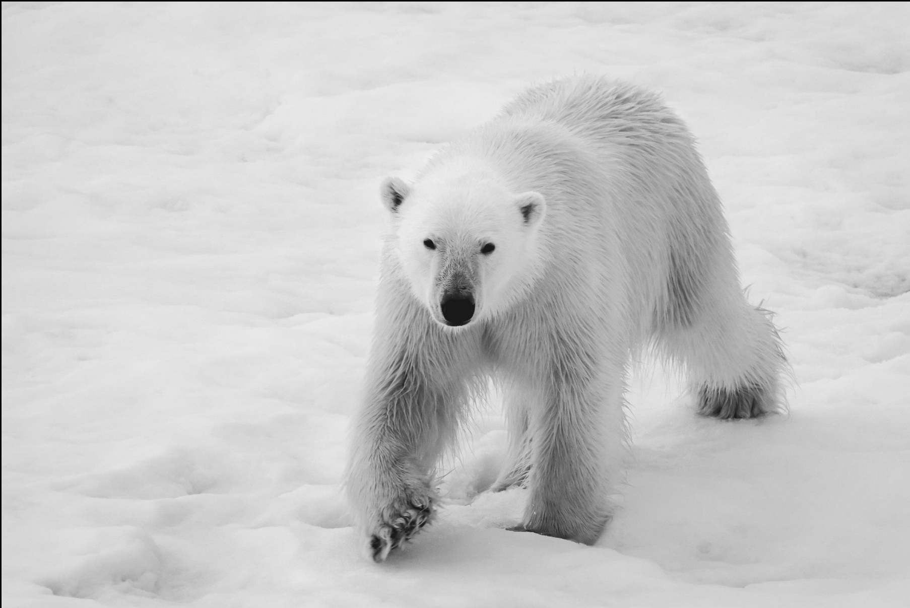
THREATENED: Ellen Henke