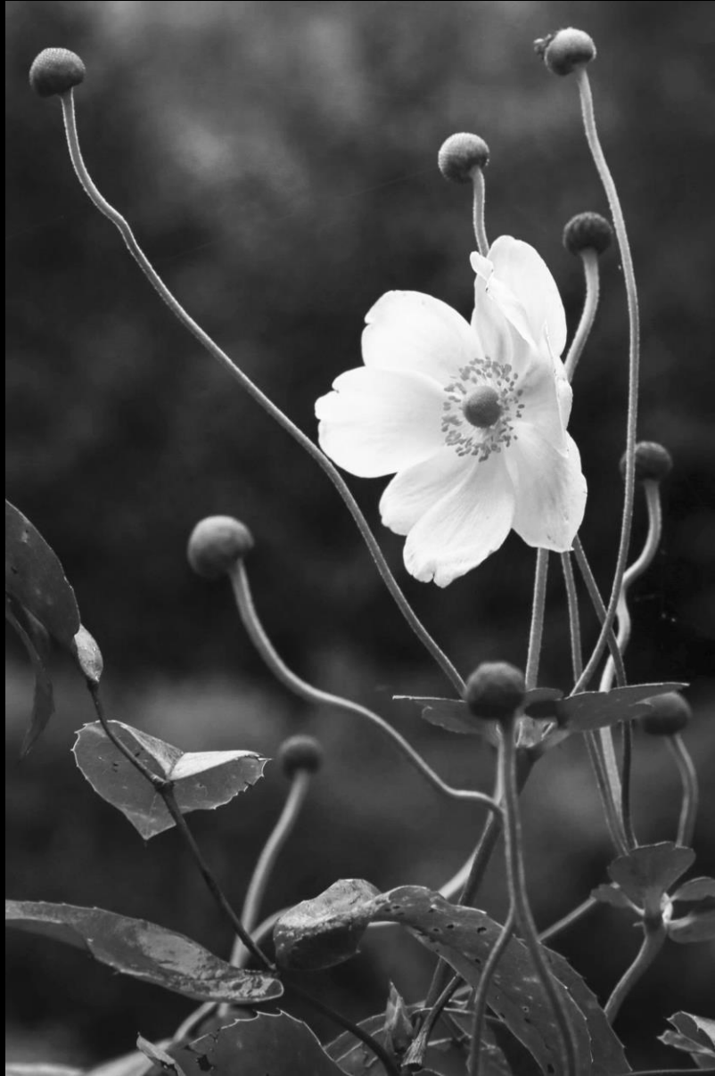
Anemone: Lorraine Wilmhurst