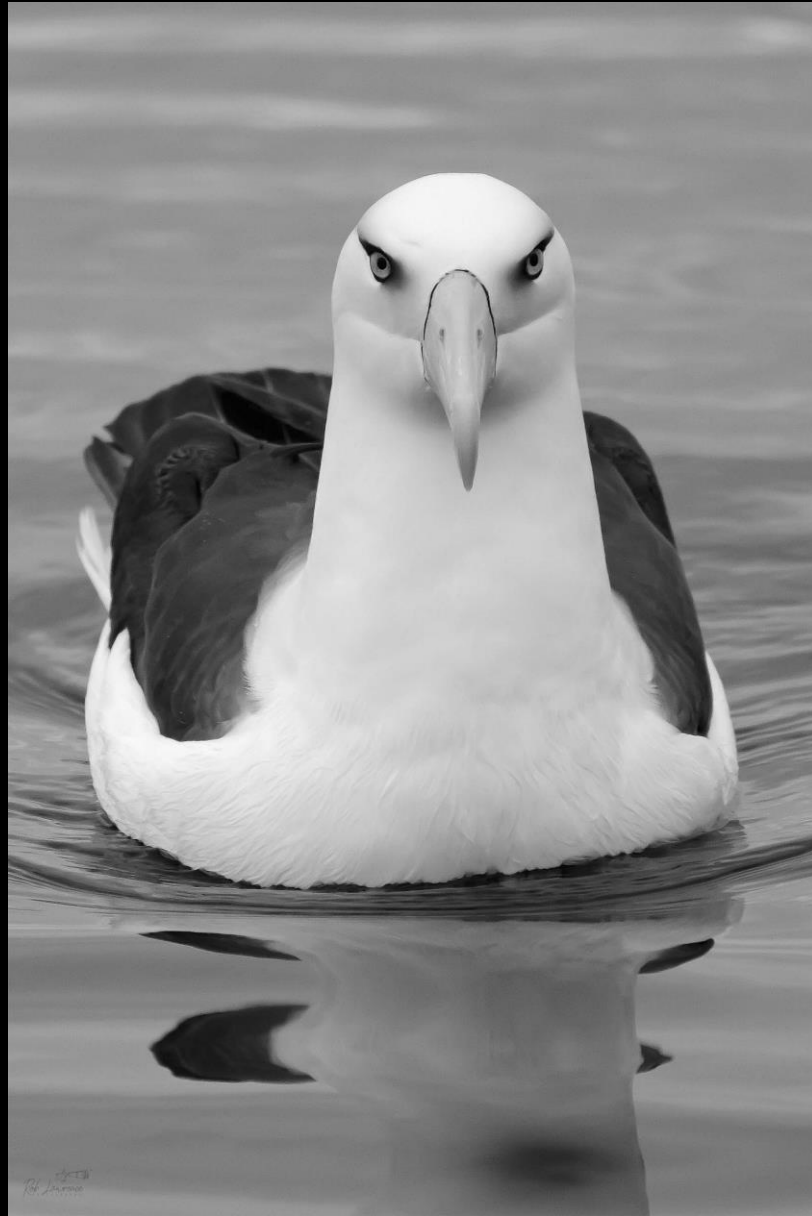
Campbell Island stare: Rob Lawrence