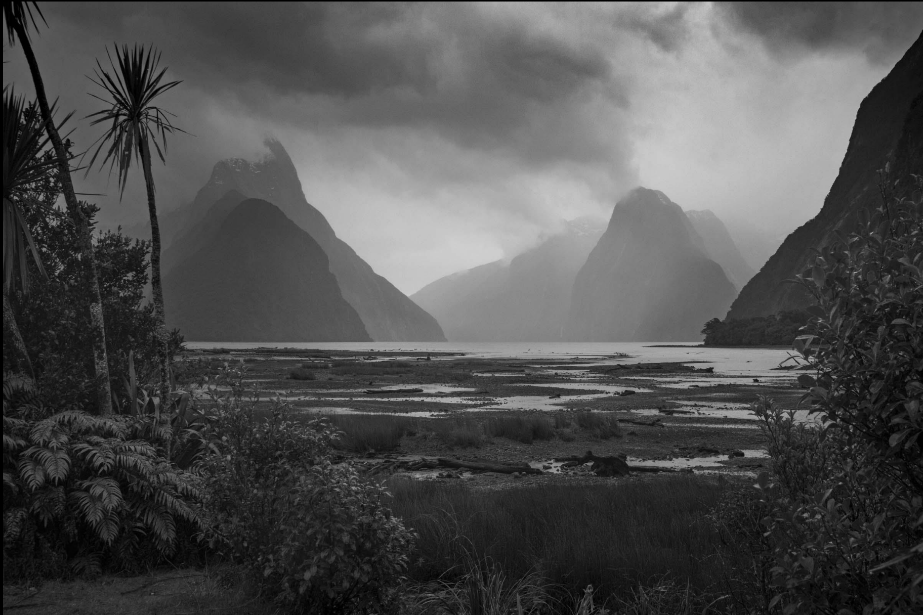
Approaching Southerly Storm, Milford Sound: Geoff Elmsly